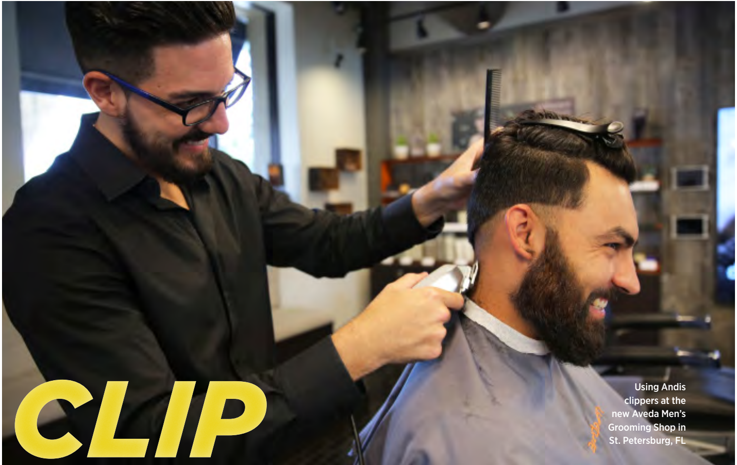
Using Andis clippers at the new Aveda Men's Grooming Shop in St. Petersburg, FL